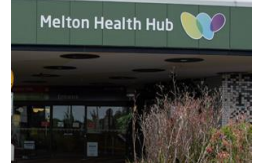
Melton Health Hub