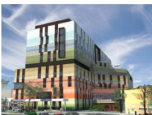
Joan Kirner Women's & Children's